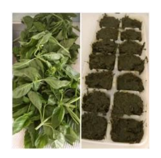
The Summer Harvest